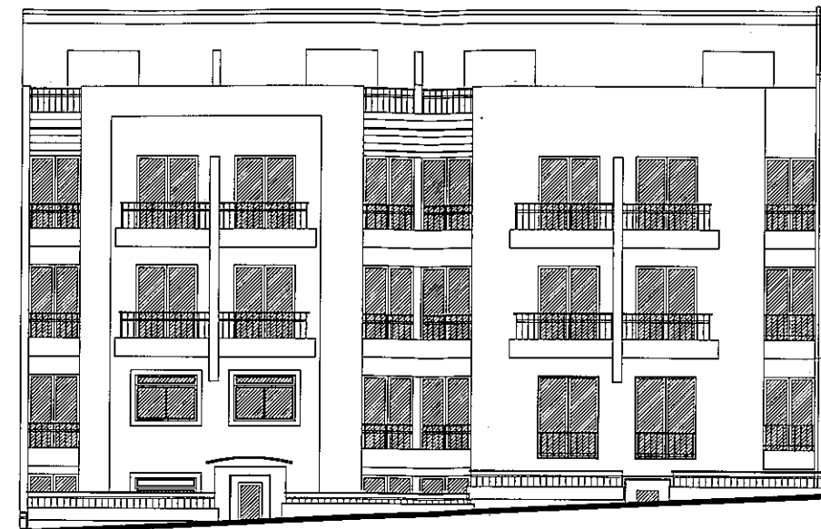
○ Proposed Facade A