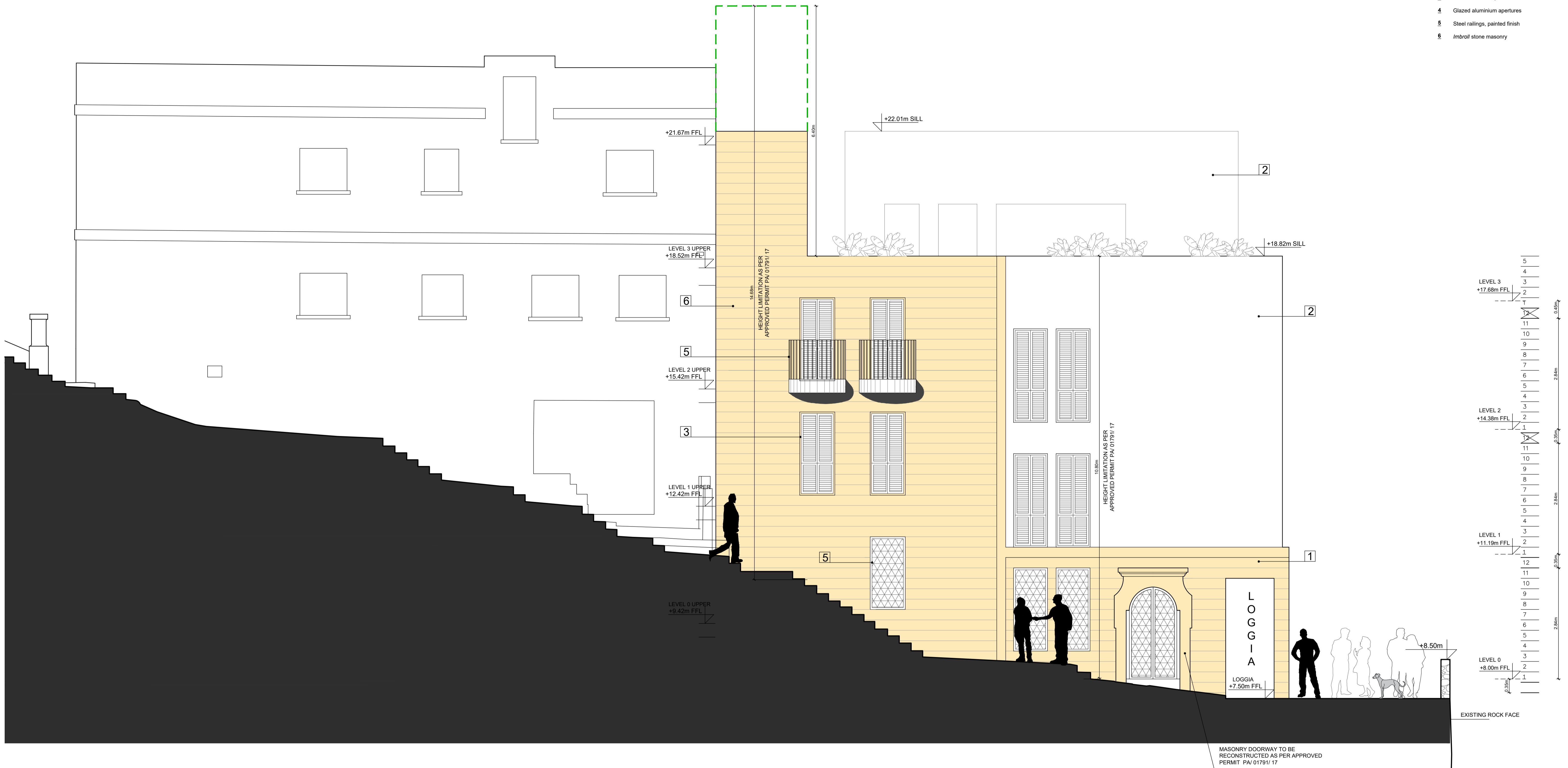
P NORTH-WEST ELEVATION A Site at Triq Santa Filumena & Triq Ganni Raimondo