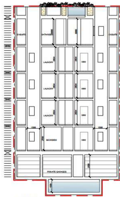
Proposed Section Y-Y Scale 1:100