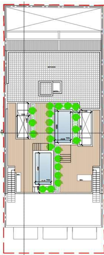
Proposed Roof Scale 1:100