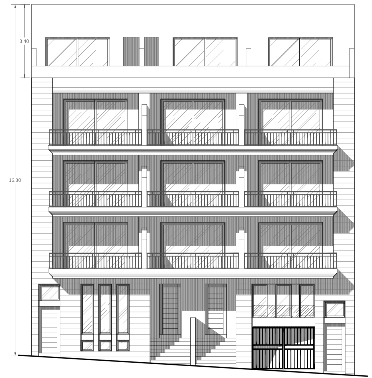
PROPOSED ELEVATION SCALE 1:100