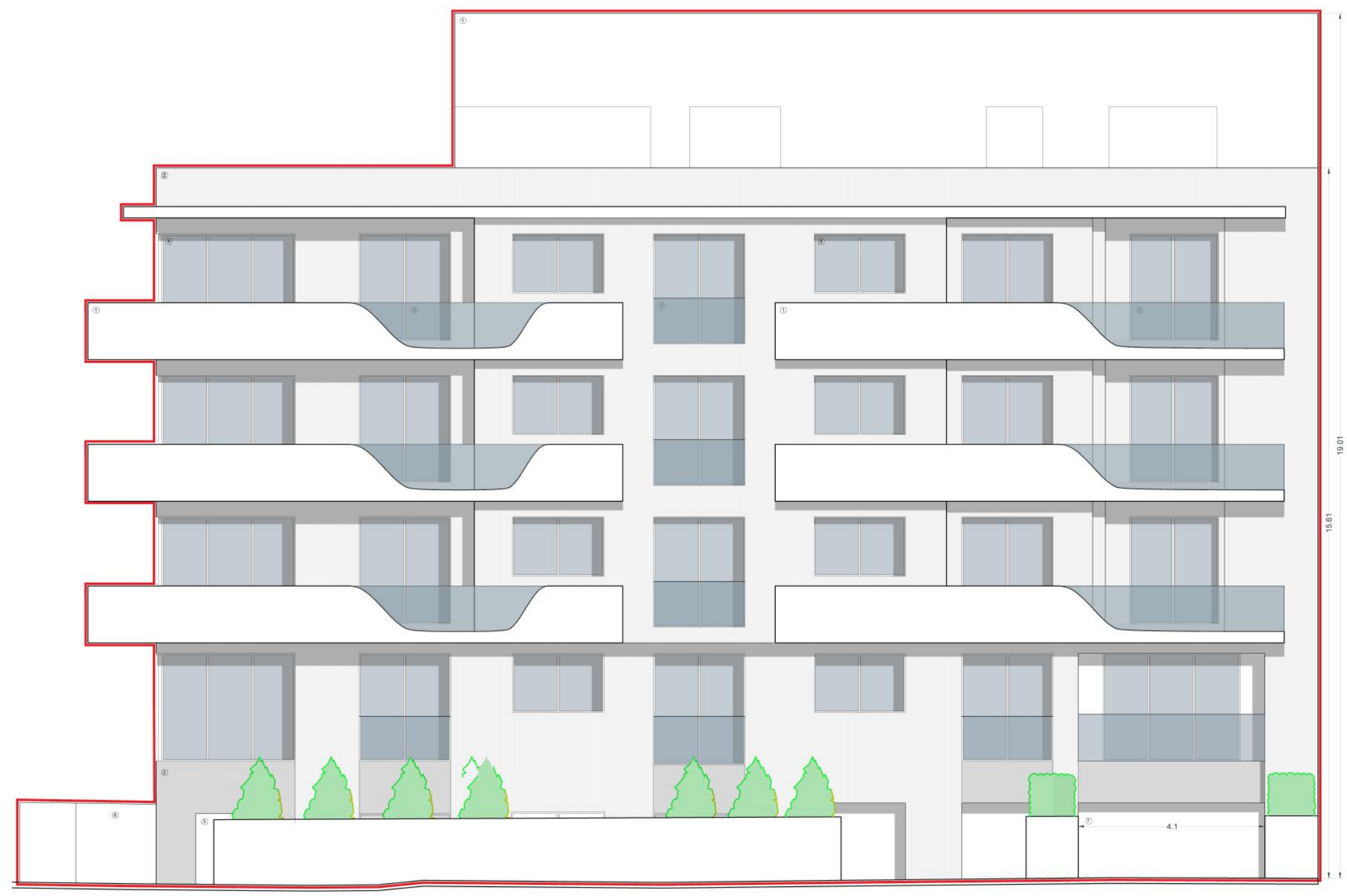
Proposed Elevation E02 Scale 1:100