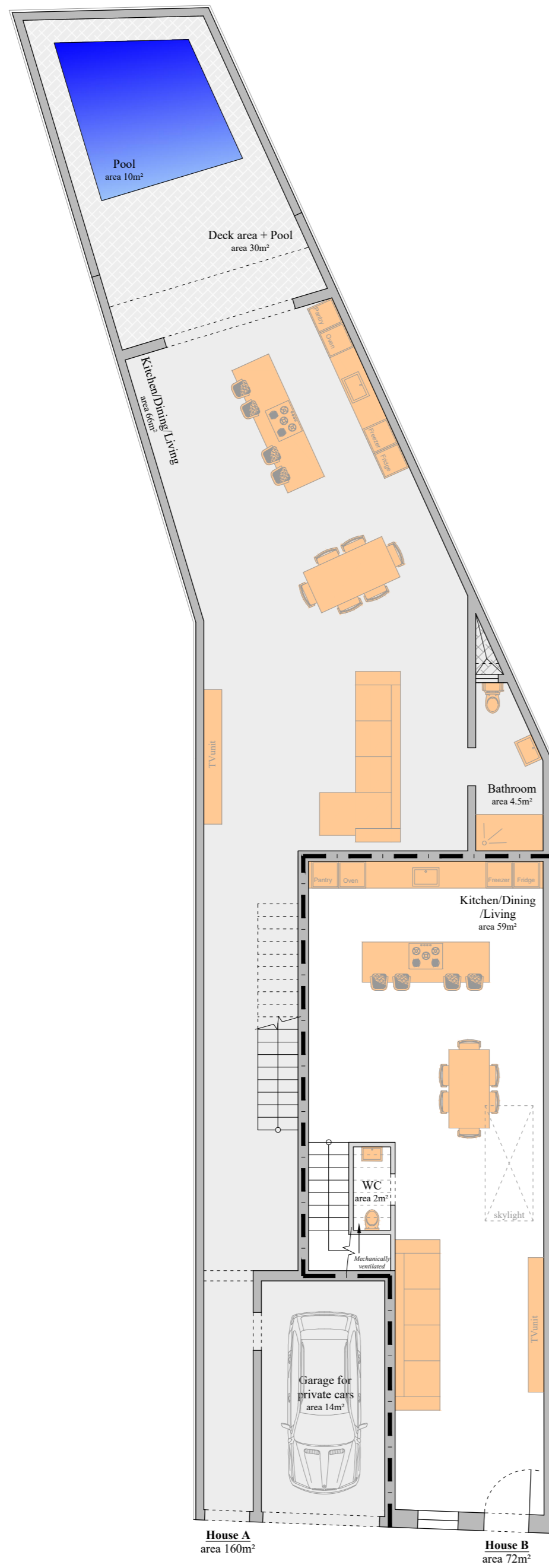
Ground Floor Plan Scale 1:100