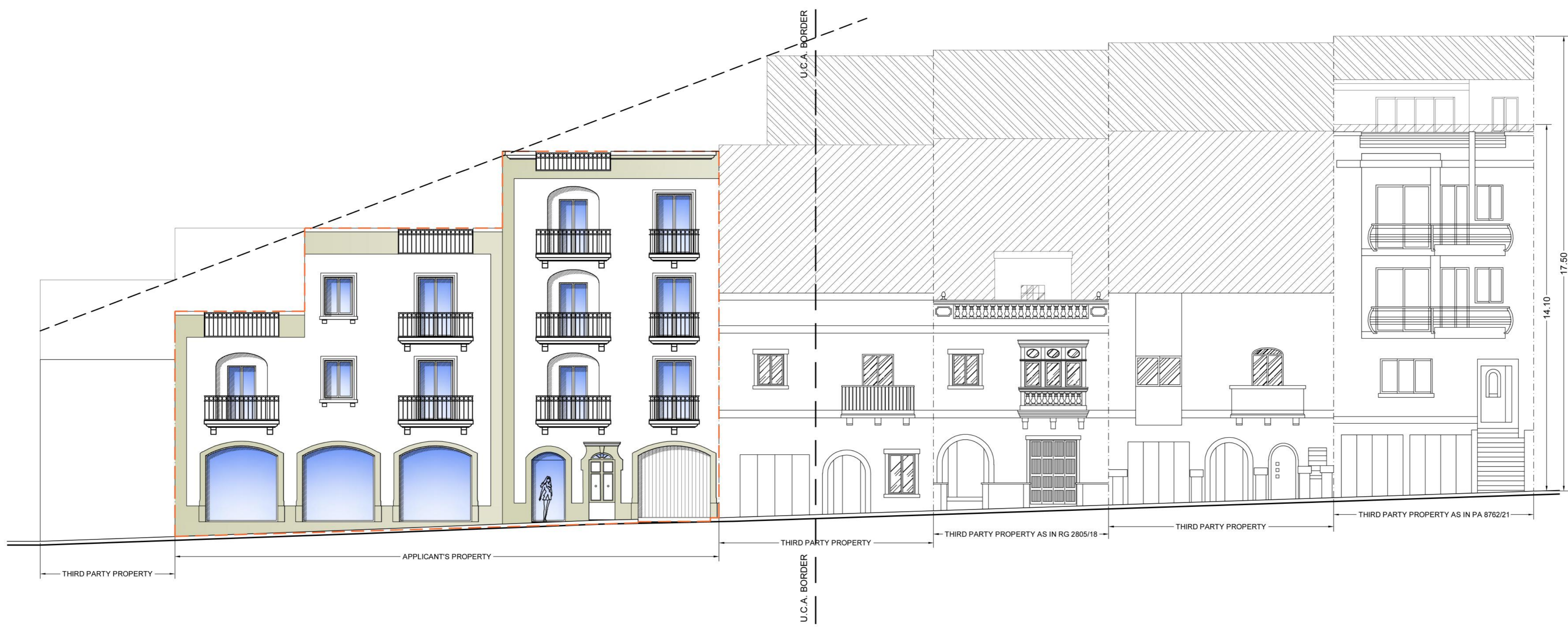
PROPOSED STREET ANALYSIS ON Scale 1:100