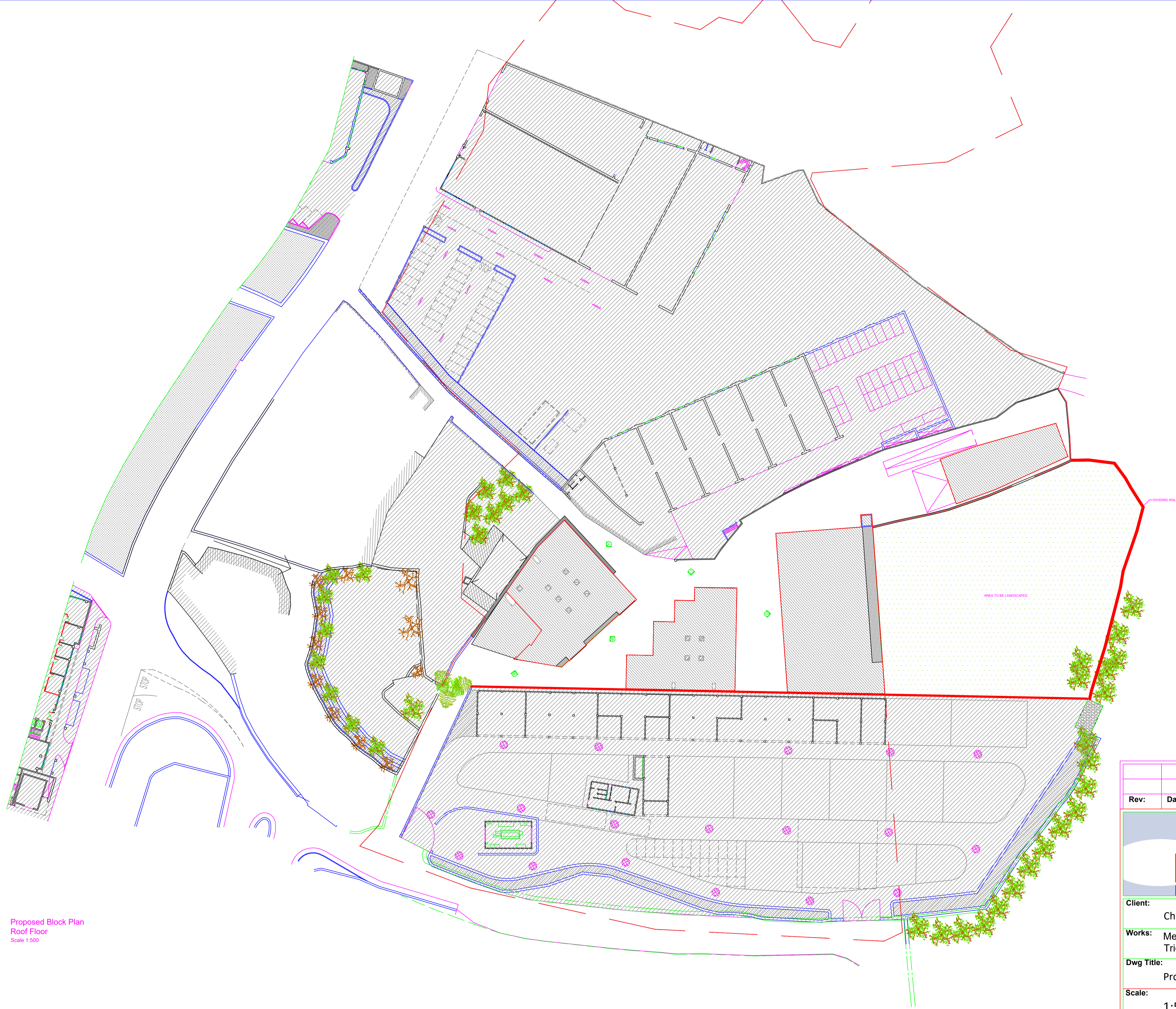
Proposed Block Plan Roof Floor Scale 1:500