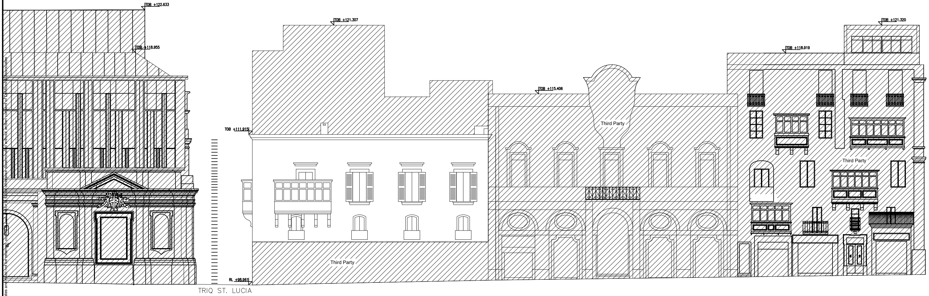
EXISTING STREETSCAPE ELEVATION ON MERCHANTS ST. SCALE 1:200