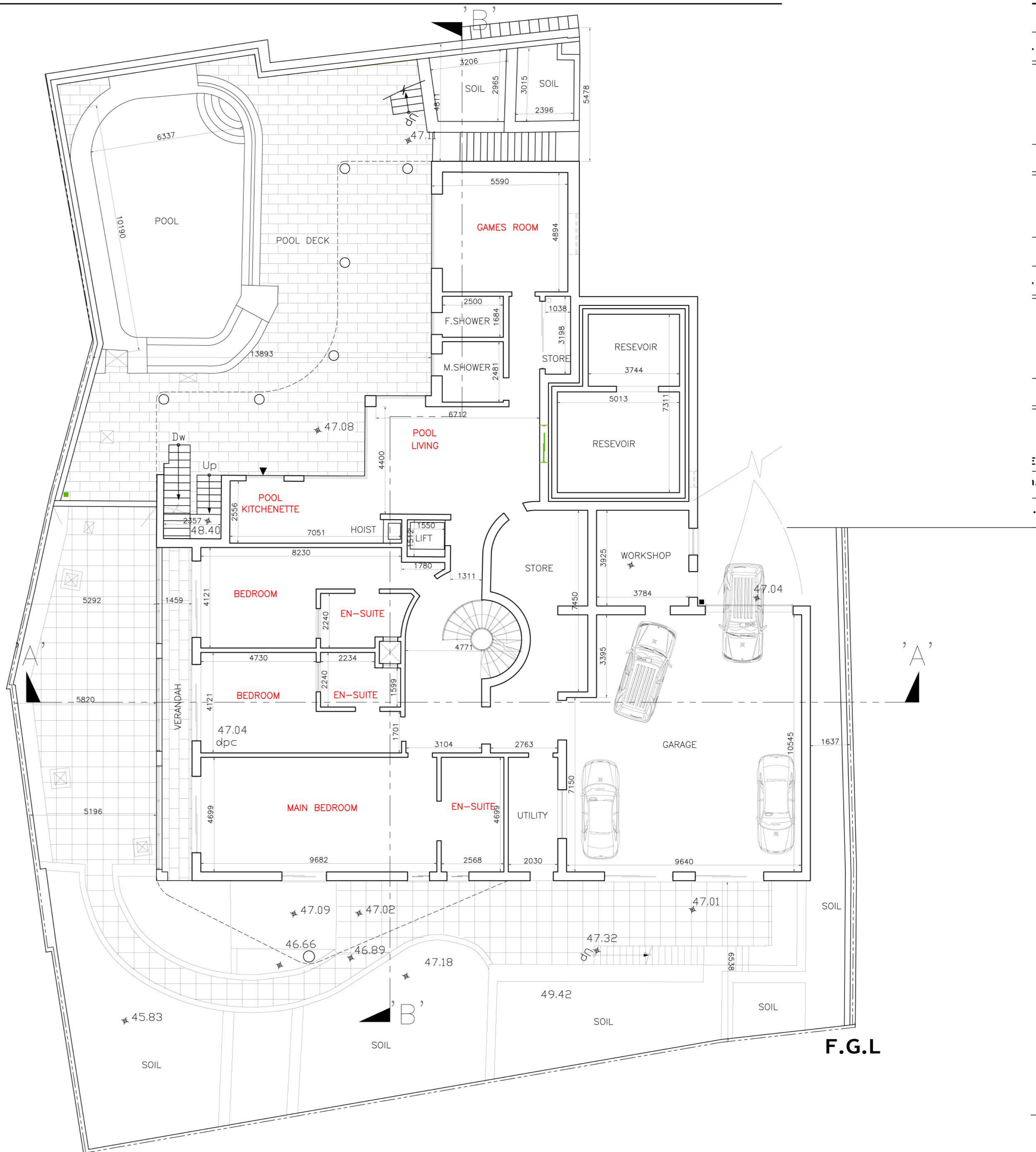
EXISTING BASEMENT PLAN