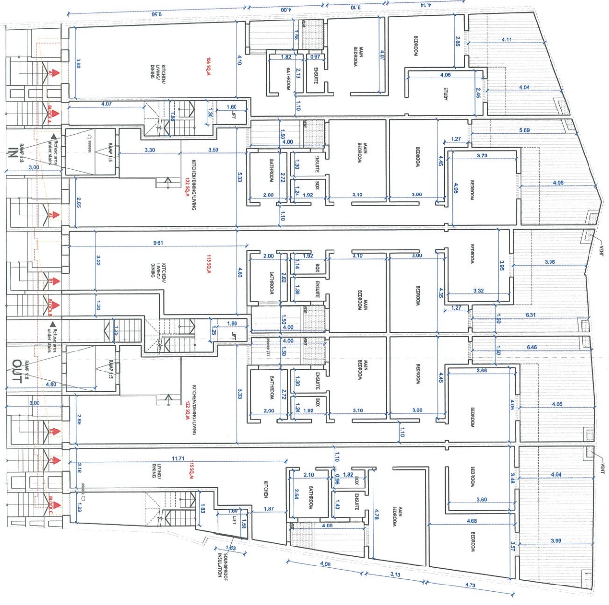
PROPOSED GROUND FLOOR SCALE 1:100