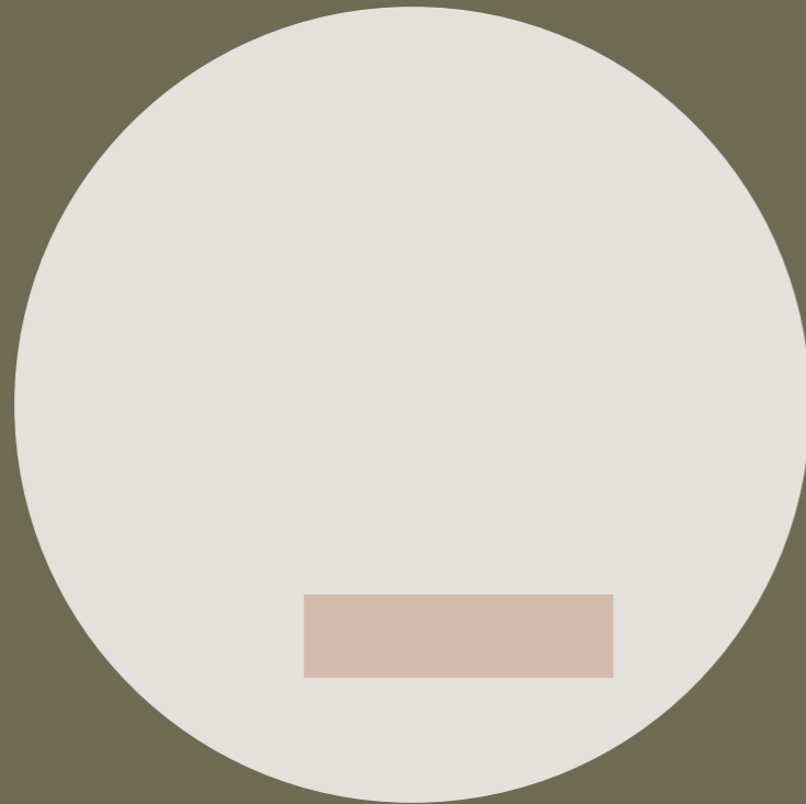
Ground floor plan – Residence No1