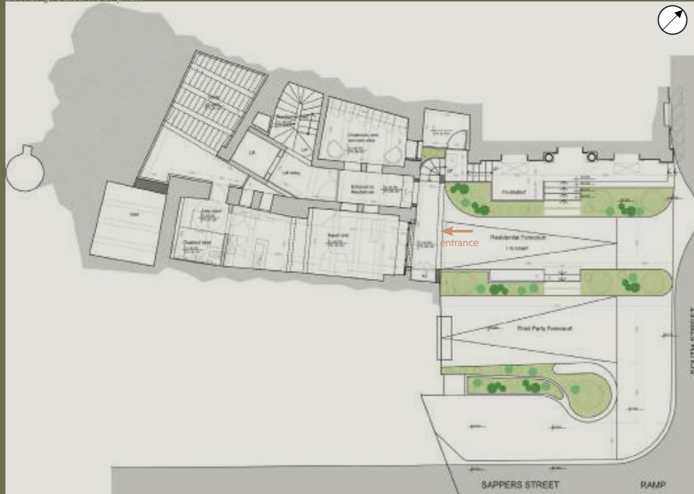
Lower ground floor plan