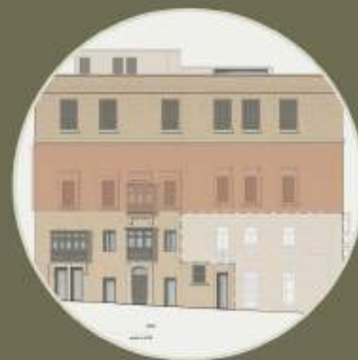
SAPPERS STREET FACADE