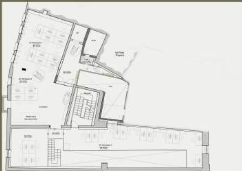
Third floor plan