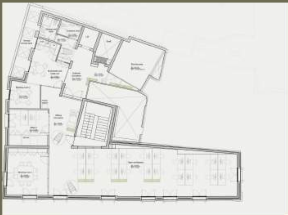
Fourth floor plan