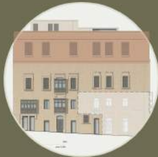
SAPPERS STREET FACADE