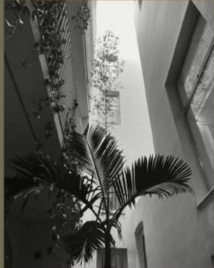
ground floor common areas