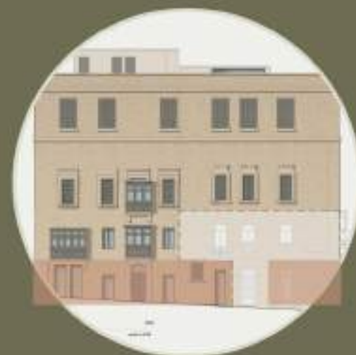
SAPPERS STREET FACADE