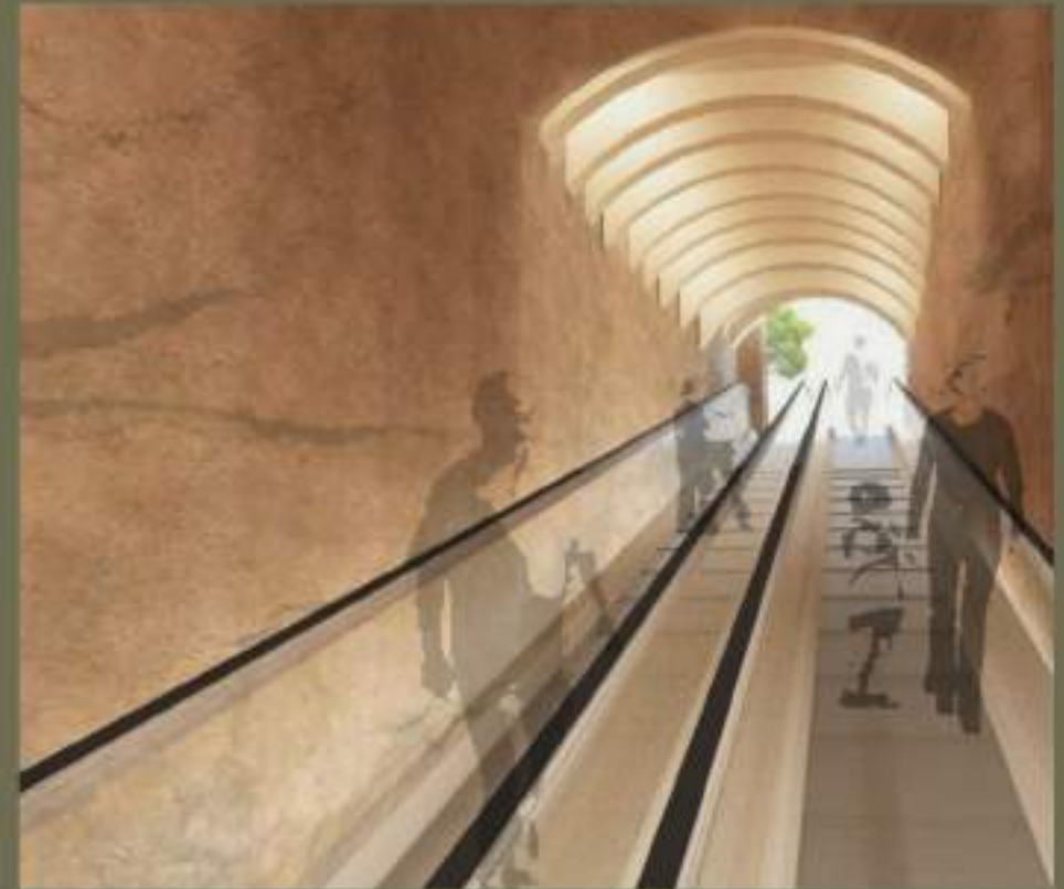
the reopening of the tunnel