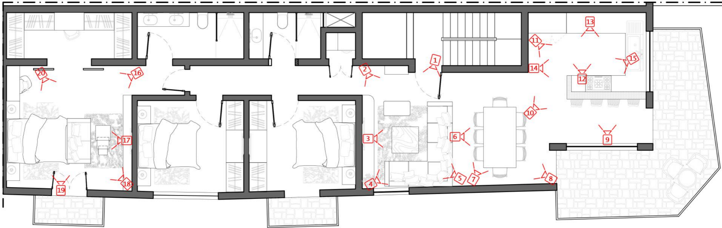
Proposed First, Second, Third