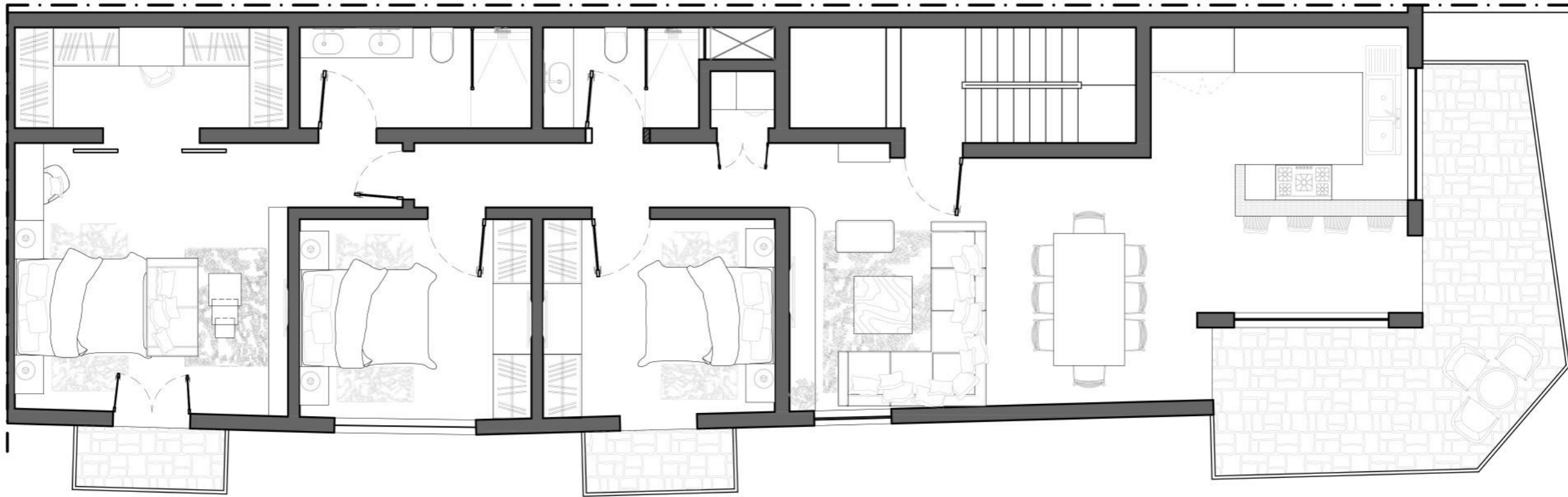
Proposed First, Second, Third