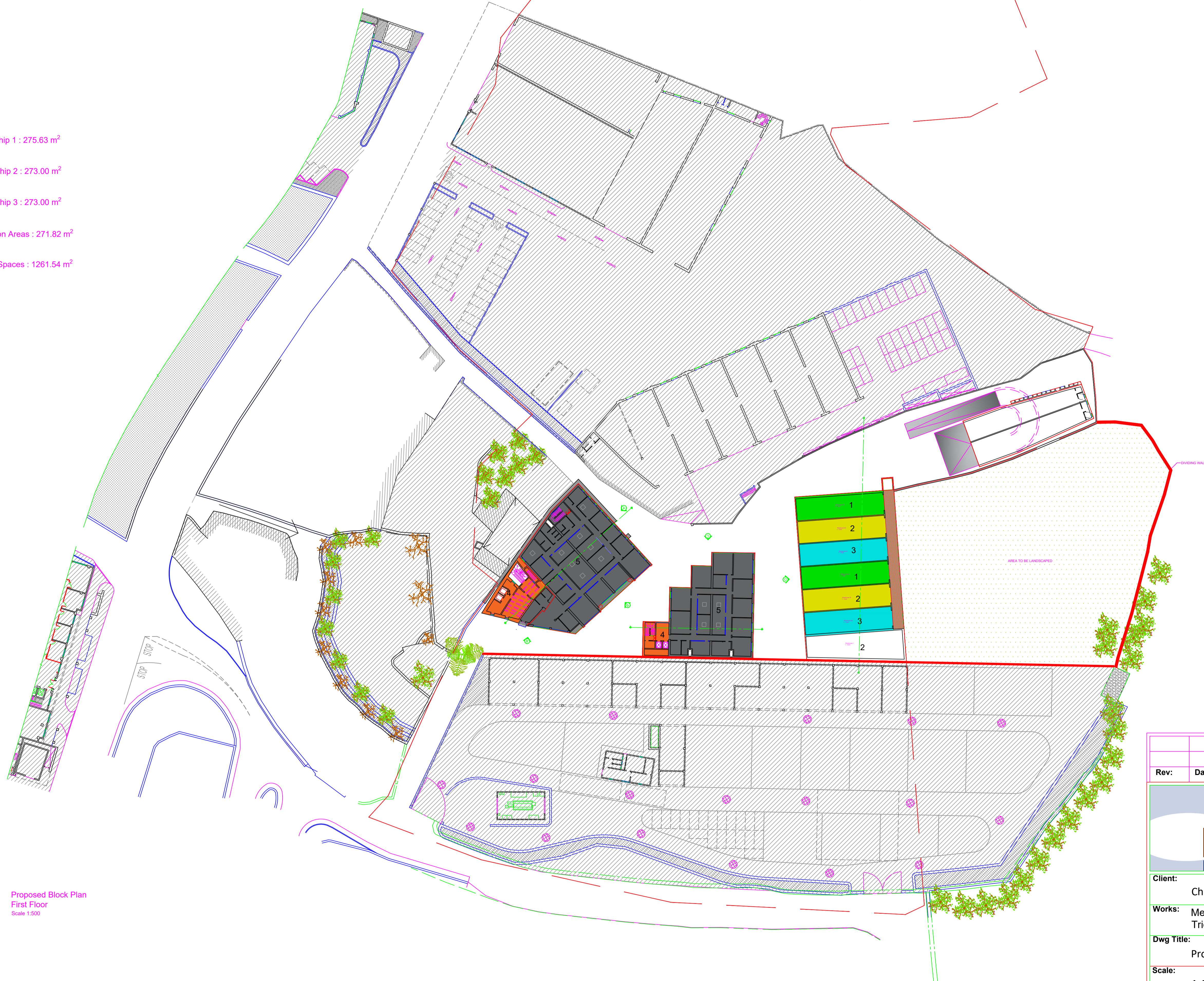
Proposed Block Plan First Floor Scale 1:500