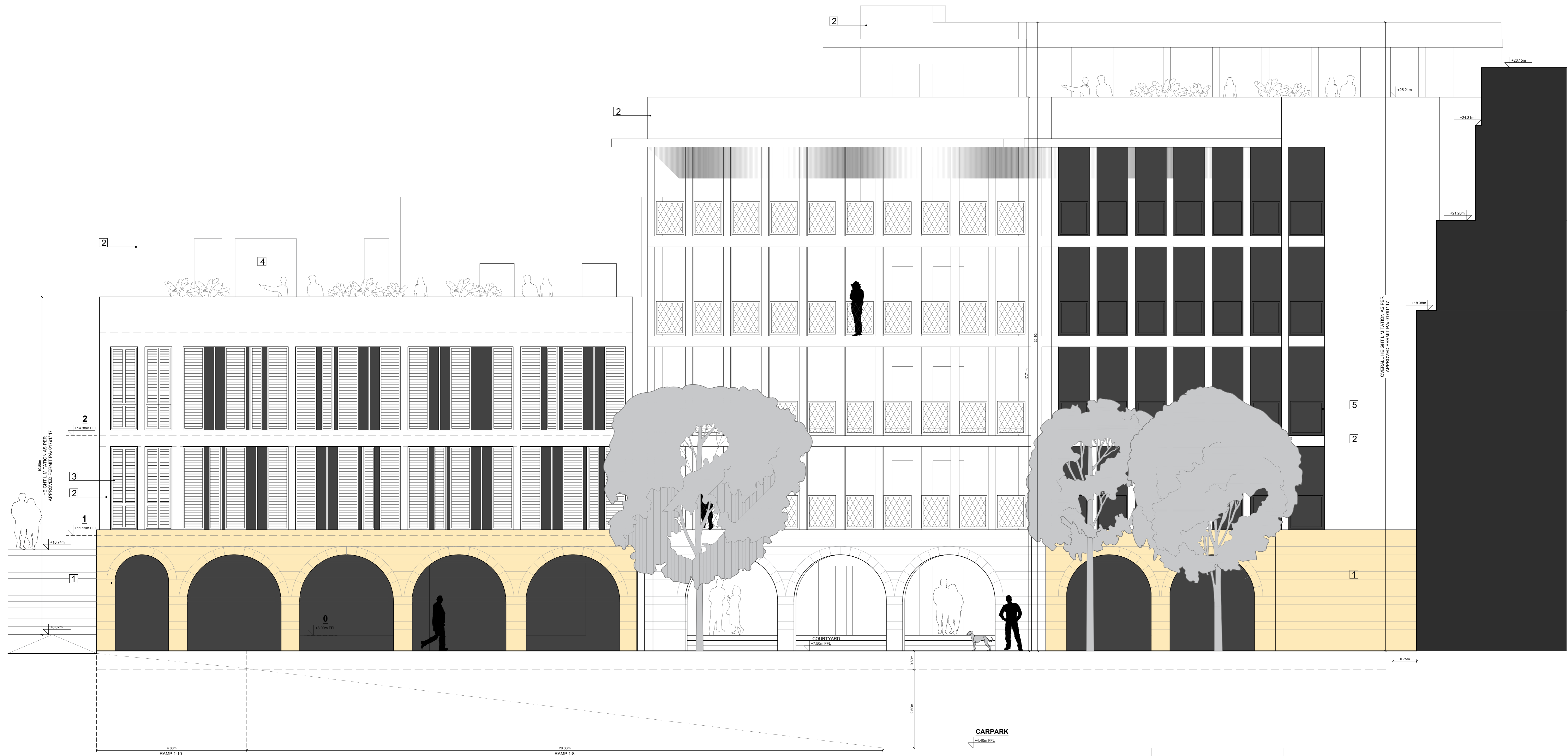
P SOUTH WEST ELEVATION C Site at Triq Santa Filumena & Triq Ganni Raimondo