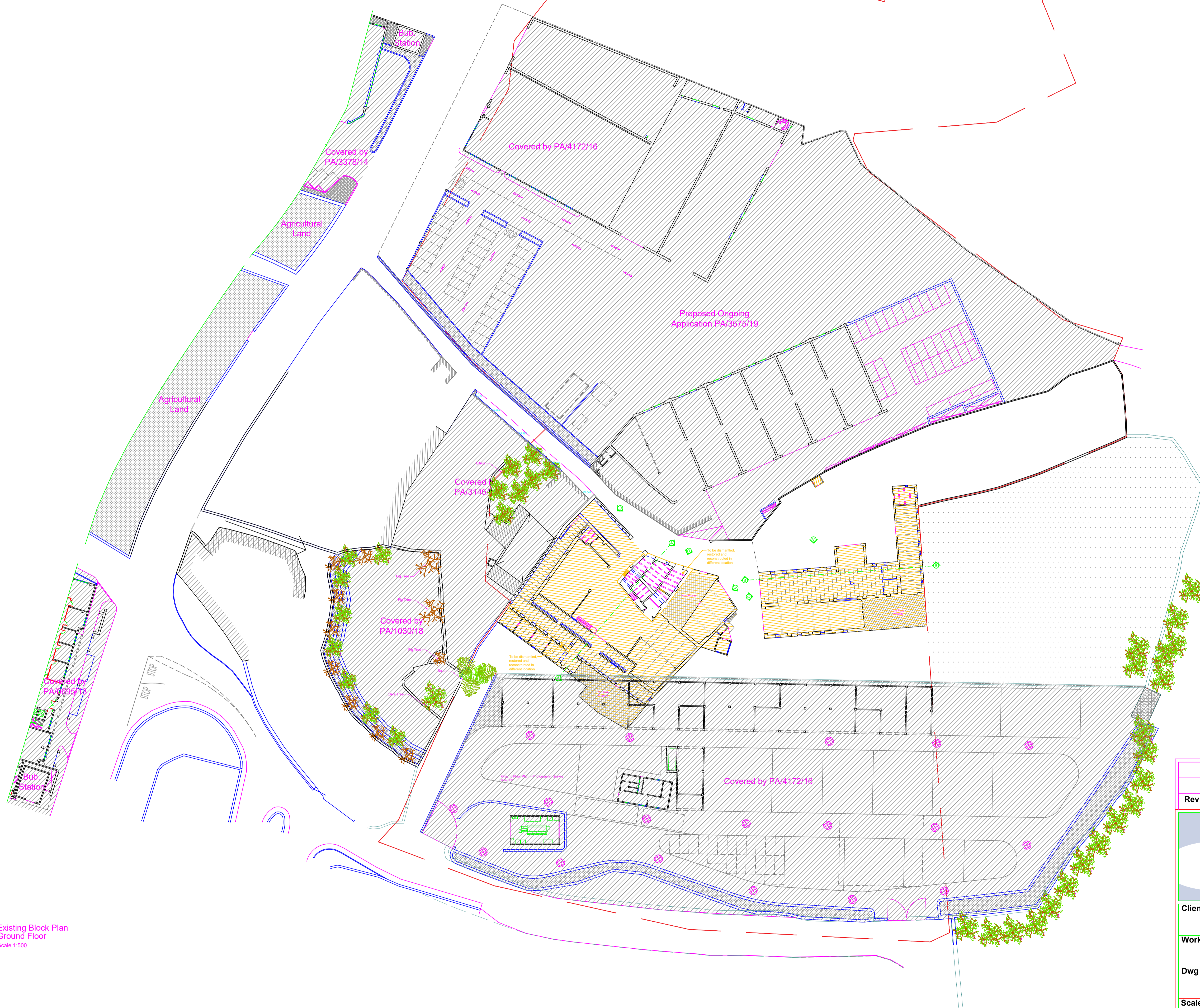
Existing Block Plan Ground Floor Scale 1:500