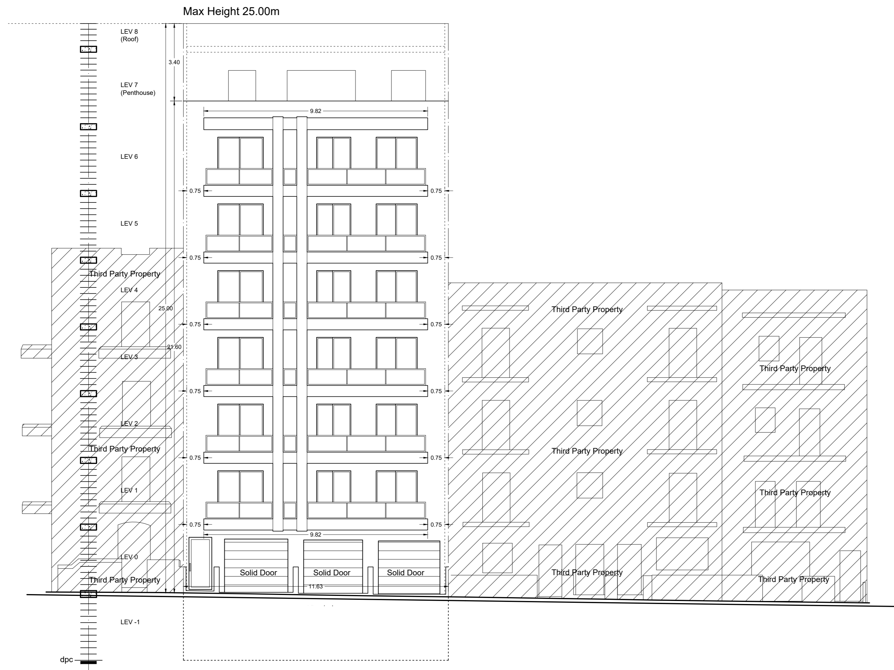
Streetscape Elevation AS PROPOSED