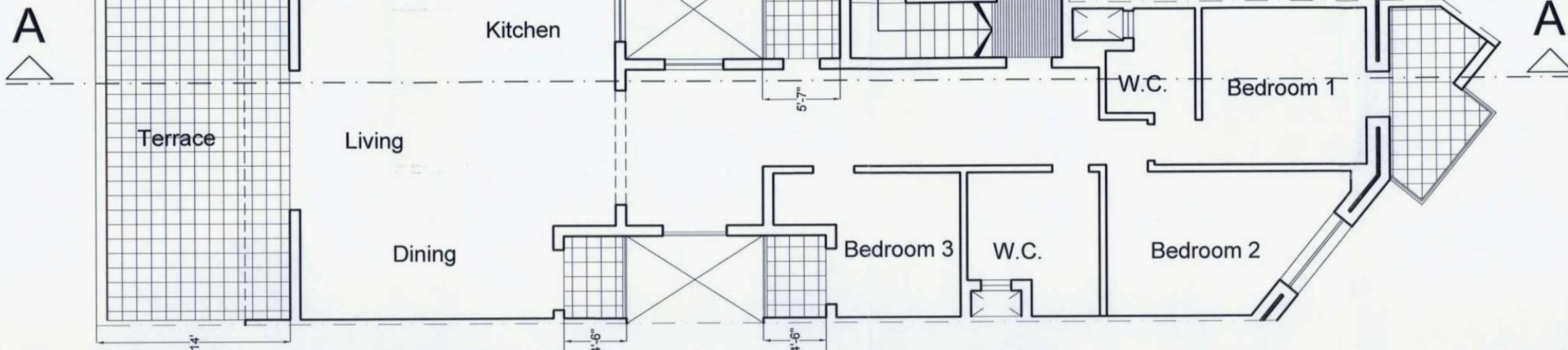
4 PROPOSED SECOND FLOOR LEVEL Scale 1:100